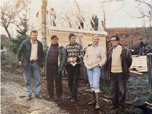
The first BhB house was constructed in Petrinja in 1991.

After 30 years of aid in Croatia, Bosnia and Kosovo, we return to the place where everything began 30 years ago – to Petrinja in Croatia.